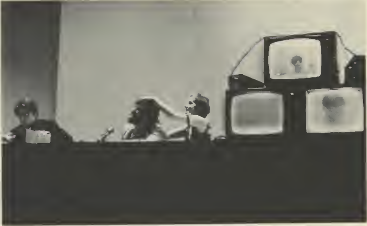
Les Levine: Television Piece , 1968. Loeb Student Center, New York University

but chose instead to show himself as a group of television images. Like the computer, television becomes an environment embedded within the more pervasive physical environment which we associate with day-to-day reality.