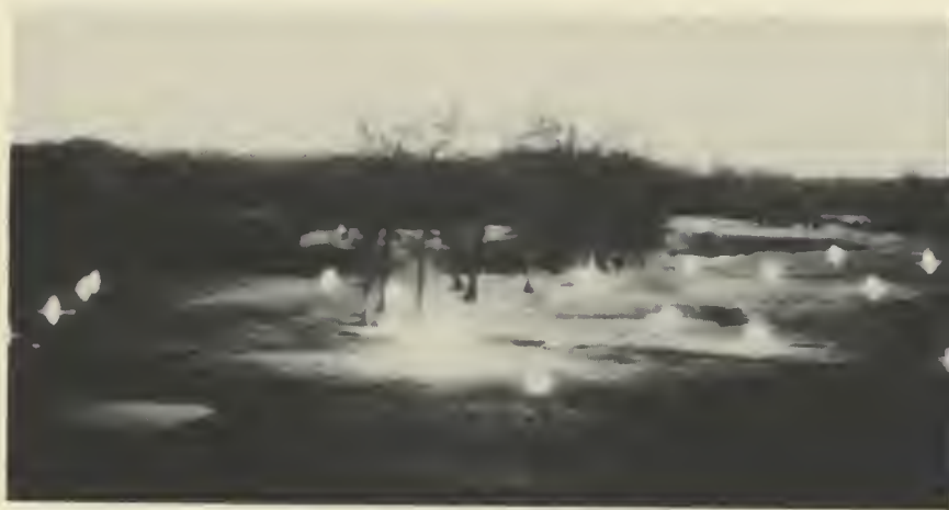
Pulsa: Light-and-Sound Installation , January–March 1969. Yale Golf Course, New Haven, Conn.

patterns. In a version shown at the Brooklyn Museum's "Some More Beginnings" exhibition, spectators could vibrate the speaker by holding a microphone next to their hearts. I should also mention James Seawright's Electronic Peristyle (1968), a circular array of twelve black formica columns containing lights, blowers, and sound-generating equipment. 1 Here the interruption of photoelectric circuits by the spectator produces a series of sounds, light patterns, and breezes. While some margin of ambiguity as to the meaning of the stimuli and their relation to the spectator is permissible and even desirable in such a work, Seawright's Electronic Peristyle fails to build into a coherent or aesthetically meaningful experience, and this remains a central deficiency of most art predicated upon the feedback principle.