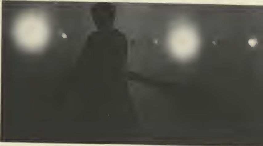
Hans Haacke: Photo-Electric Viewer-Programed Coordinate System , 1966-1968

resistor switches which are nearly invisible to the spectator. The switches control the lights just above them, so that the spectator defines his own presence by reading the light grid. Haacke would like to eliminate specific light sources like the row of light bulbs used and to utilize only the pale and diffused illumination from the wall itself. The spectator's relationship with the room and his ensuing aesthetic experience are precipitated by his own bodily activities; no contemplation of or empathizing with an object is necessary.