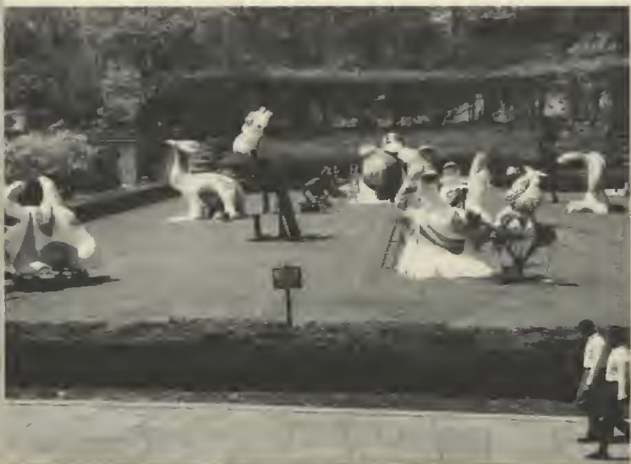
Exhibition of works by Niki de St. Phalle and Jean Tinguely in Central Park, summer 1968