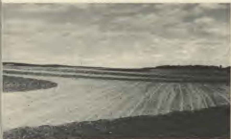
Dennis Oppenheim: Pennsylvania Wheat Piece , 1968