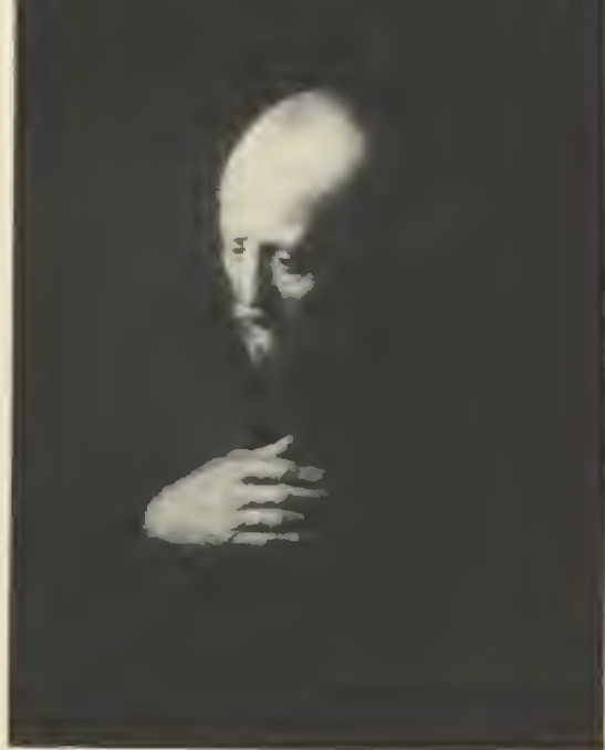
Rembrandt: Portrait of the Artist's Father , c. 1630. Collection Museum of Fine Arts, Boston

Kenneth Noland exhibition at André Emmerich Gallery, New York, 1967